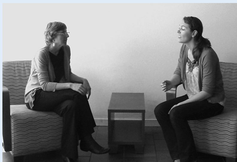
Top: Fairmount Apartments' grand opening poster with a before and after picture of rehabilitation project.